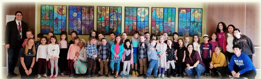
FRS students in Kindergarten through first grade last year at the Kline Galland Home in Seattle on their annual a spring holiday concert.

Our mission is to build a vibrant school where students actively live Jewish lives expressed through their actions and values. The Frankel Religious School creates a foundation for fostering deeper connections to Judaism, Herzl-Ner Tamid, Israel and the modern world. We strive to provide a welcoming and enthusiastic community where all family members can find multiple ways to connect. Interfaith and non-traditional families have an important place at the table of learning in FRS as we engage in continuous learning from babies to bubbies.