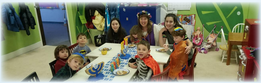
Learning at FRS is student centered and focused on what each student needs. Just take it from our pre-gan students, FRS is fun because we're all best friends!