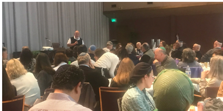
92 congregants and staff attended security training

You will know it when you see it. See Something, Say Something (by calling the synagogue) or if there is an emergency, dial 911.