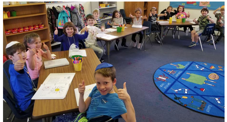
Thumbs up to learning at FRS where all students are best friends.