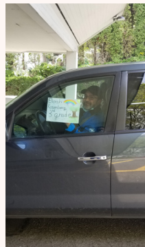
FRS Drive: Thanks to all the FRS parents who came to pick up the FRS student material in April. The FRS community continued to persevere and endure all year long.