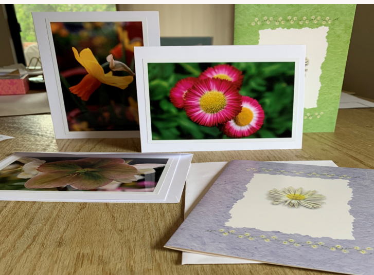
Today's Rabba to Kellie Israel for making these beautiful cards for congregants that live in communal housing.